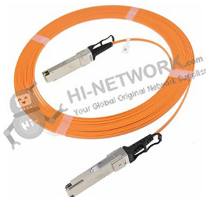
Figure 1 shows the appearance of QSFP-H40G-AOC2M.